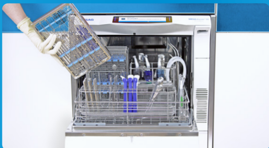
✓ Cleaning & disinfection with MELAtherm

Distinctive as a product, unbeatable in a system: