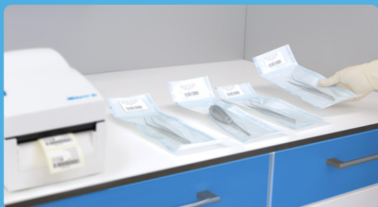
✓ Marking with MELAprint 80