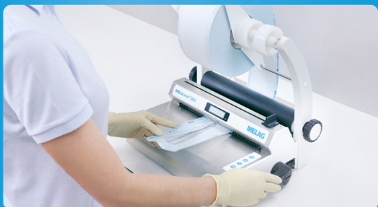
✓ Packaging with MELAseal or MELAstore