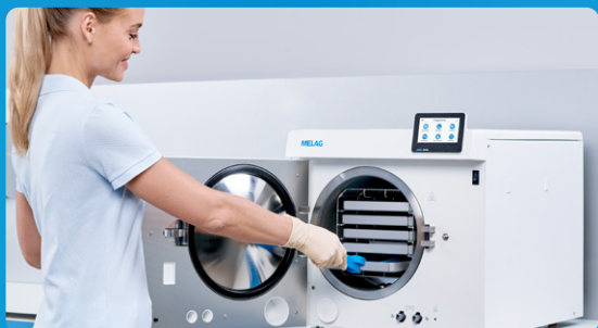
✓ Steam sterilisation with Vacuclave